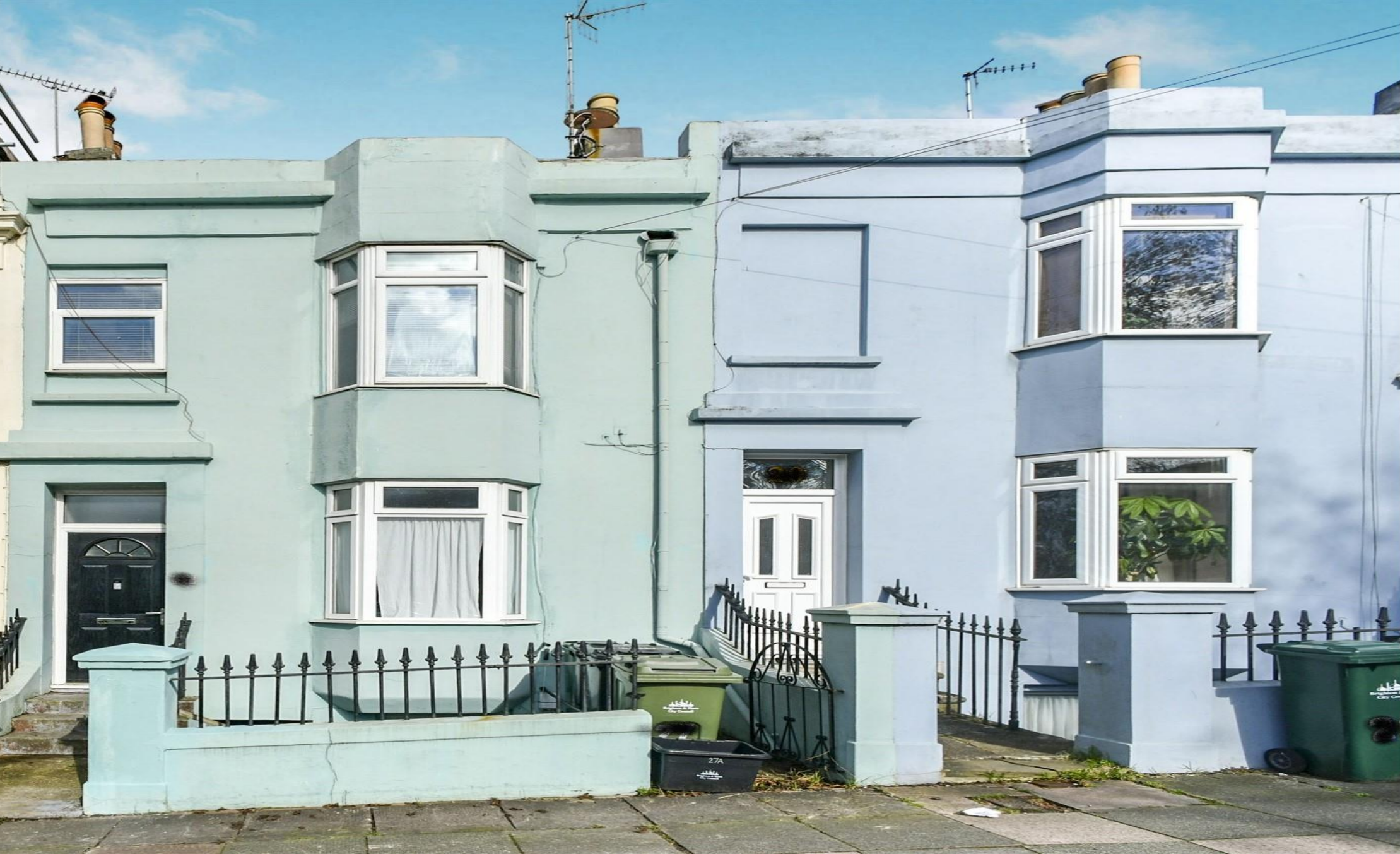
Elm Grove, Brighton BN2 3ET