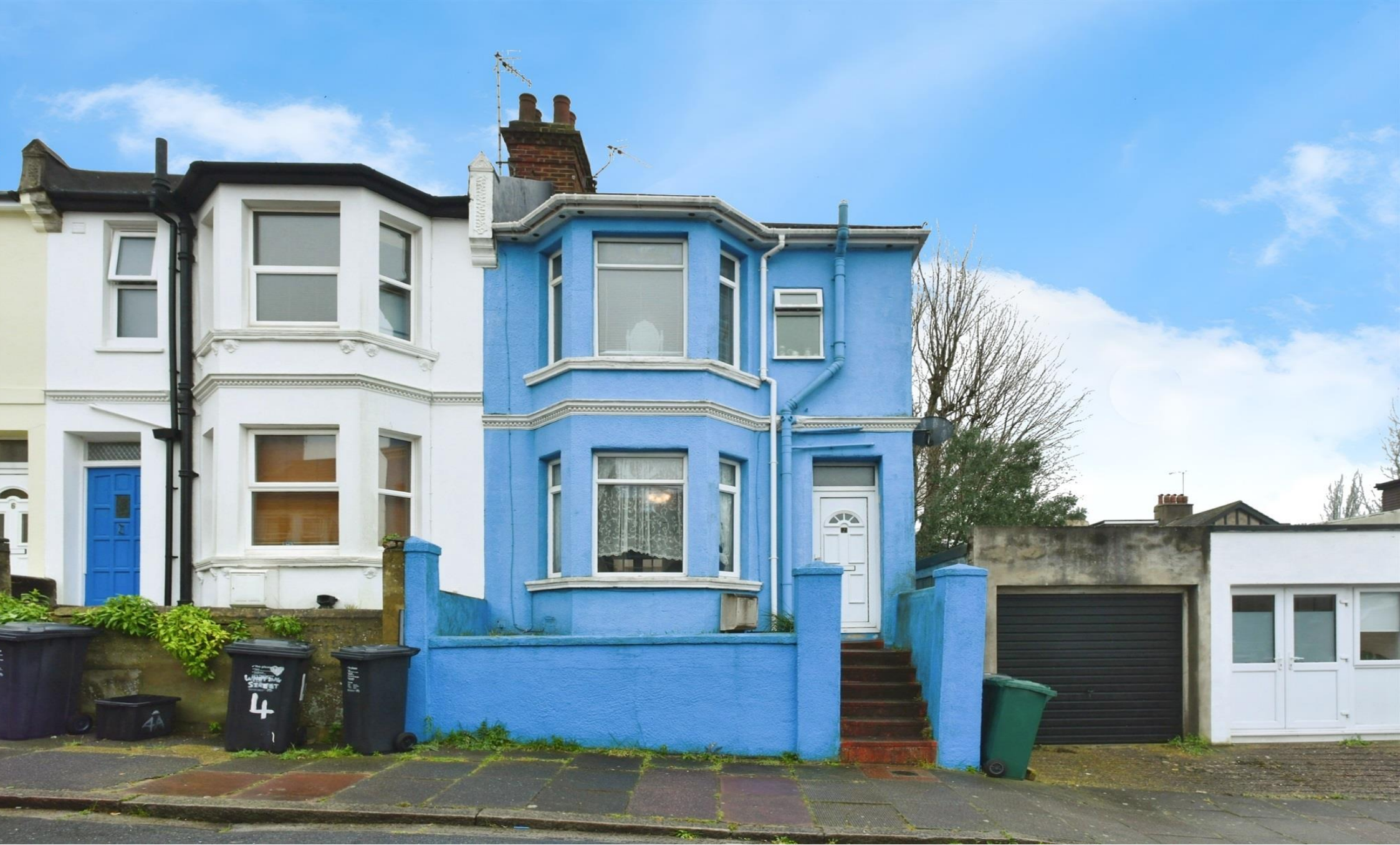
Whippingham Street, Brighton BN2 3LL