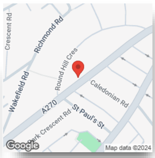
Please note the marker reflects the postcode not the actual property