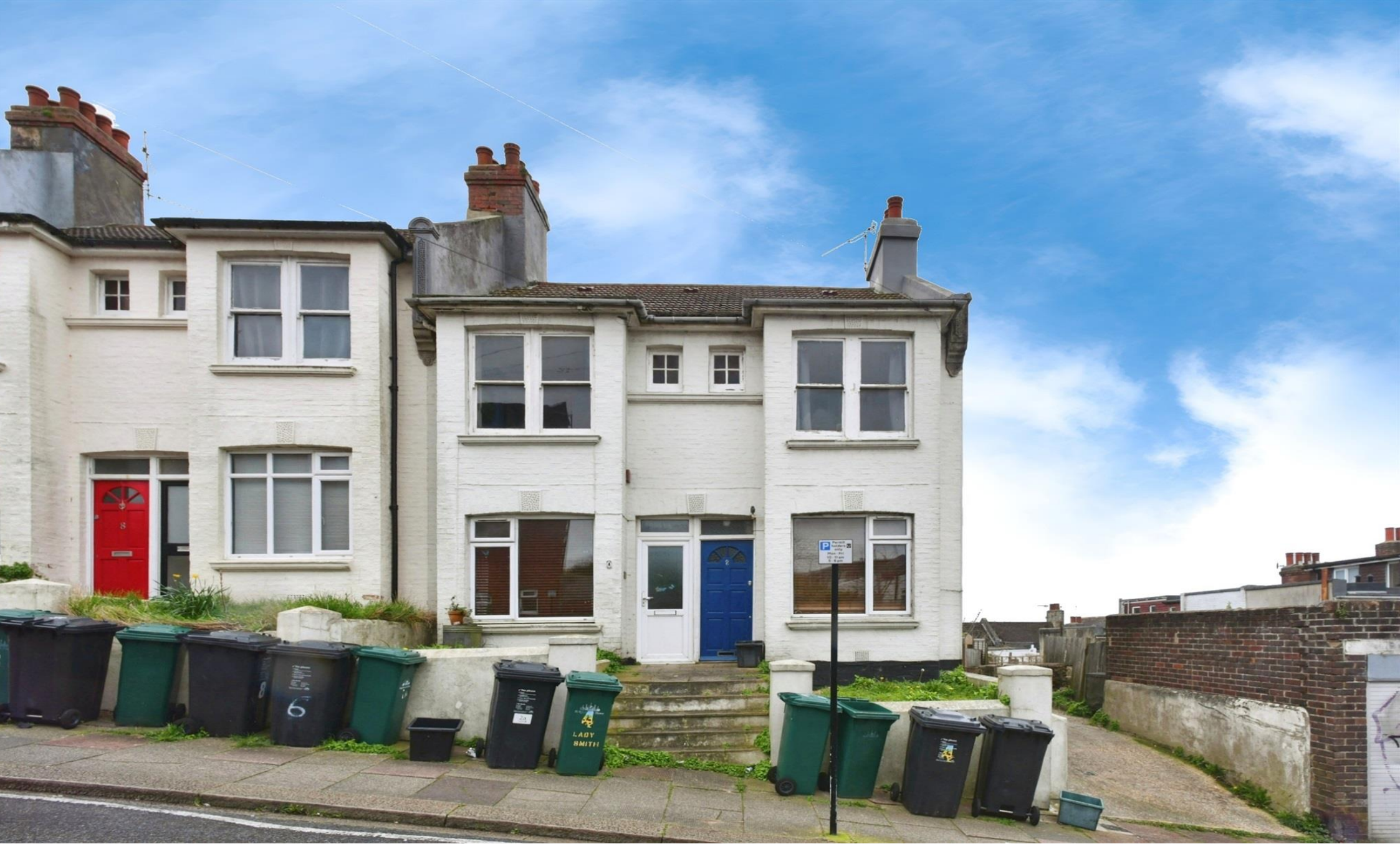
First Floor Flat, Ladysmith Road, Brighton, BN2 4EJ