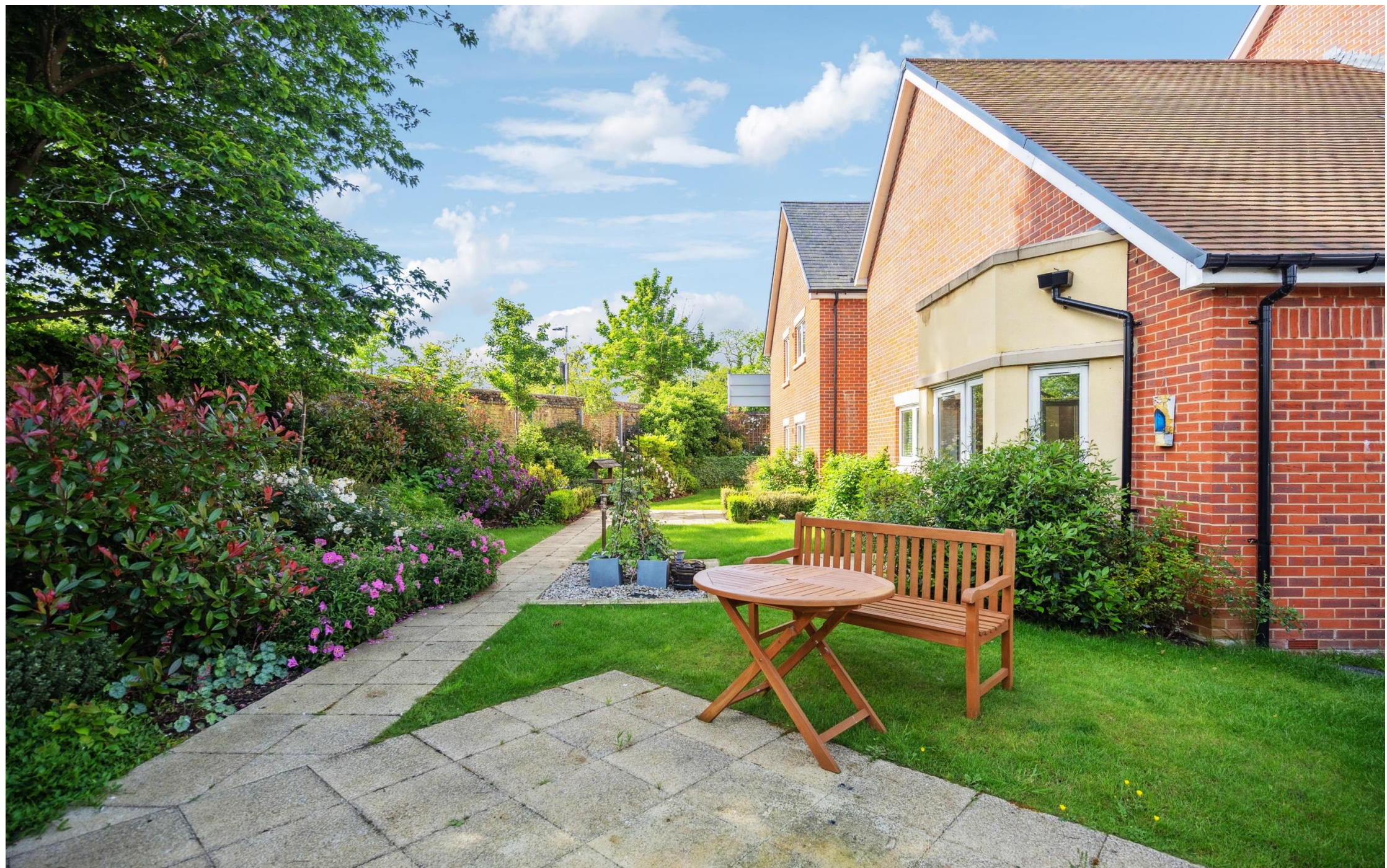
YEATS LODGE GREYHOUND LANE THAME OXFORDSHIRE