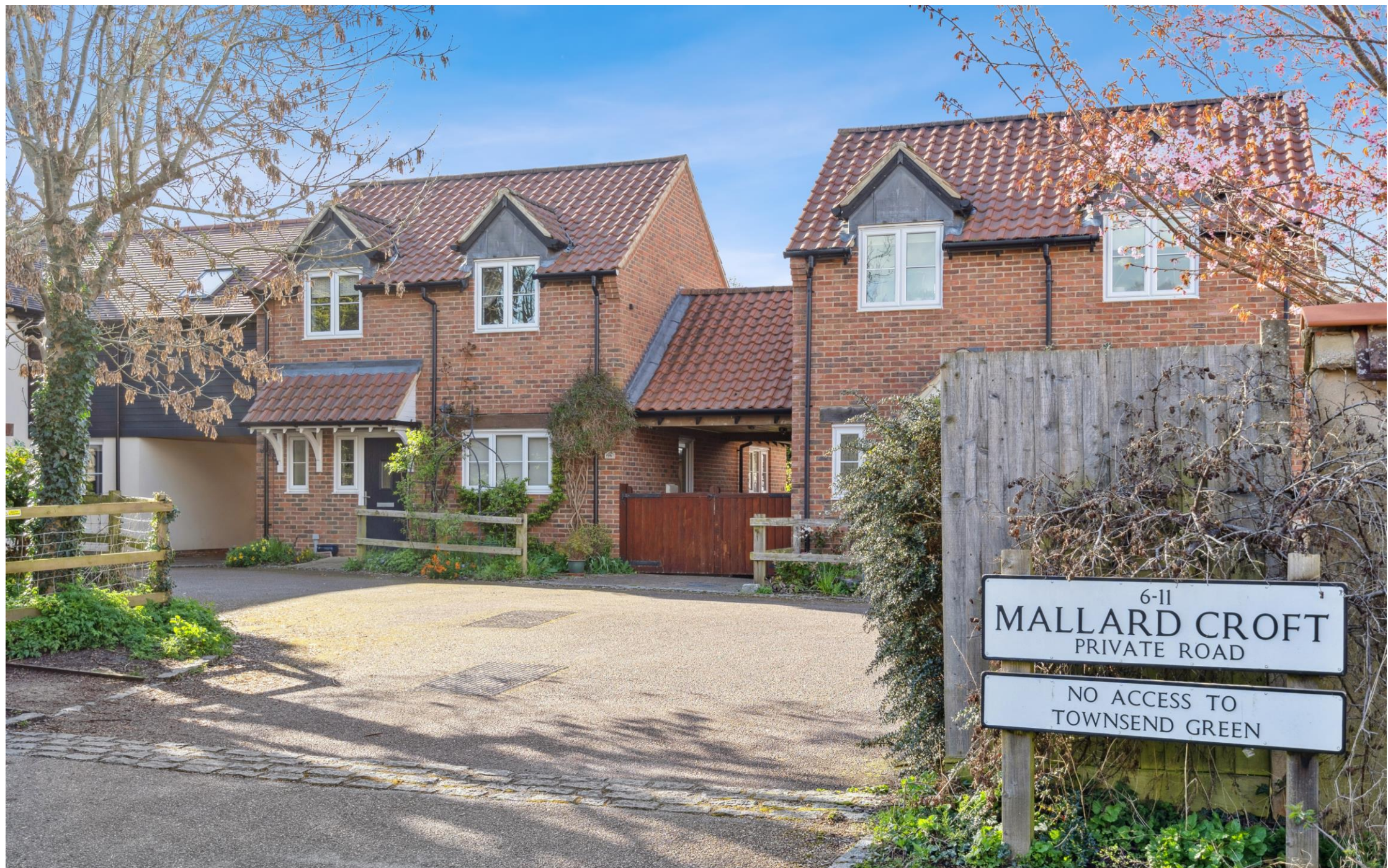
MALLARD CROFT HADDENHAM BUCKINGHAMSHIRE