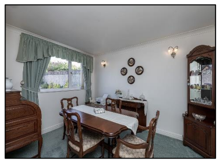
OPEN-PLAN KITCHEN/BREAKFAST ROOM 2 RECEPTION ROOMS CONSERVATORY 3 BEDROOMS & BATHROOM/W.C. PVCu DOUBLE GLAZING