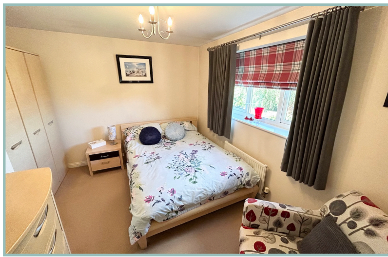
Bedroom Four 10' 1" x 9' 3" 3.07m x 2.82m