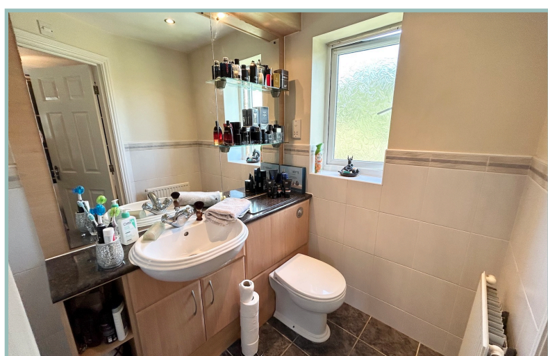
En-Suite Shower Room 8' 3" x 4' 10" 2.51m x 1.47m