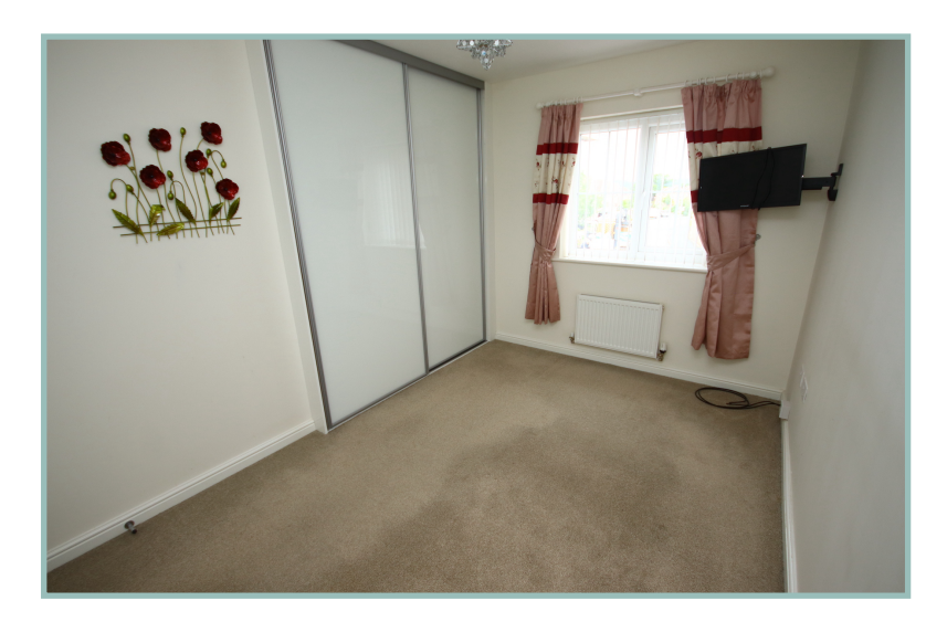
Bedroom Three 10' 4" x 7' 4" 3.15m x 2.23m

Bedroom Two 12' 3" x 8' 6" 3.73m x 2.59m