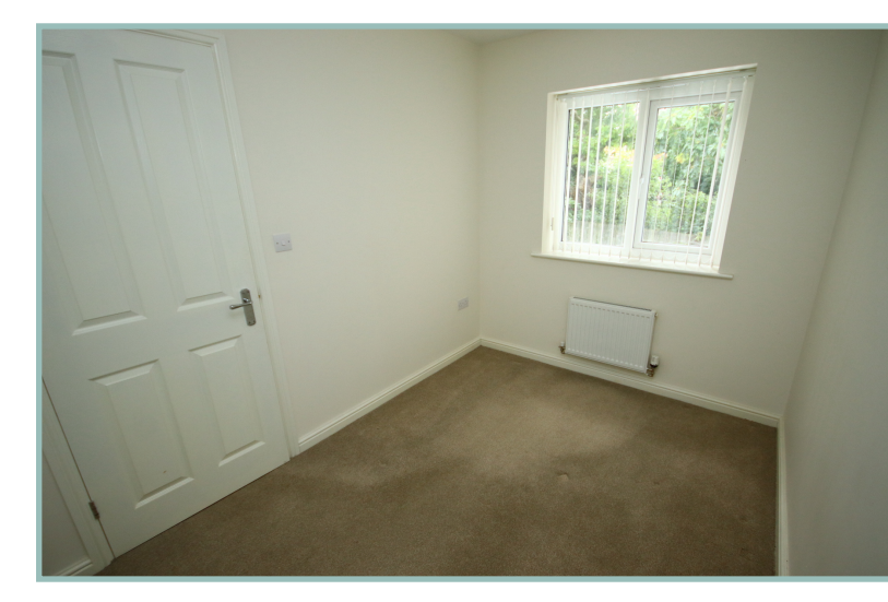
Bedroom Four 8' 4" x 7' 2" 2.54m x 2.18m