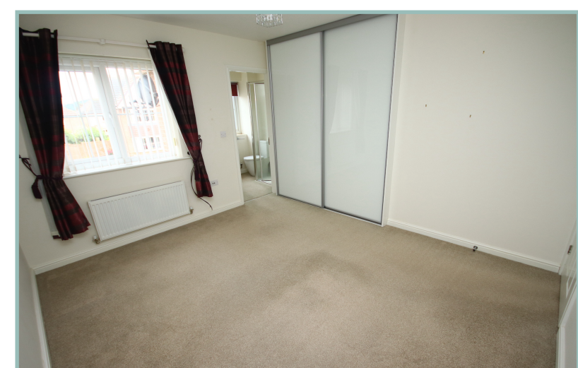
Bedroom One 12' 4" x 10' 07" 3.76m x 3.22m

Bedroom Two 12' 3" x 8' 6" 3.73m x 2.59m