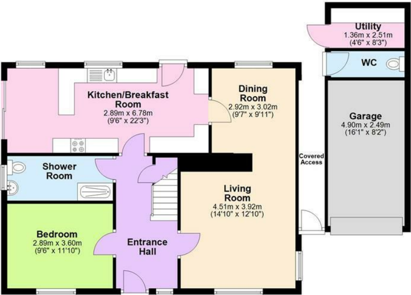
First Floor Approx. 66.4 sq. metres (714.7 sq. feet)

Please note that the dimensions stated are taken from internal wall to internal wall. Ground Floor Approx. 97.8 sq. metres (1052.6 sq. feet)