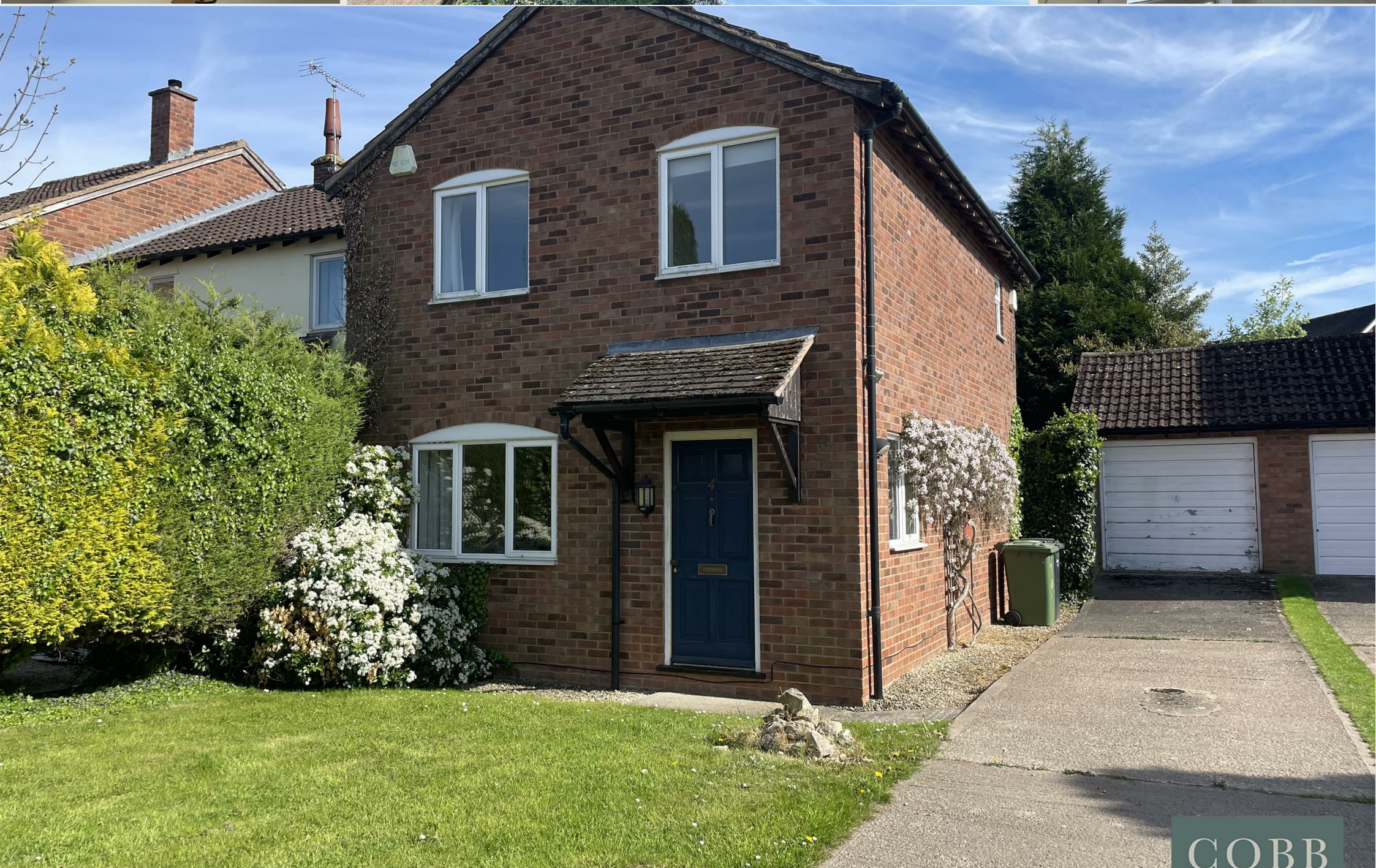
4, Orchard Close, Hereford, HR1 3JJ Price £270,000