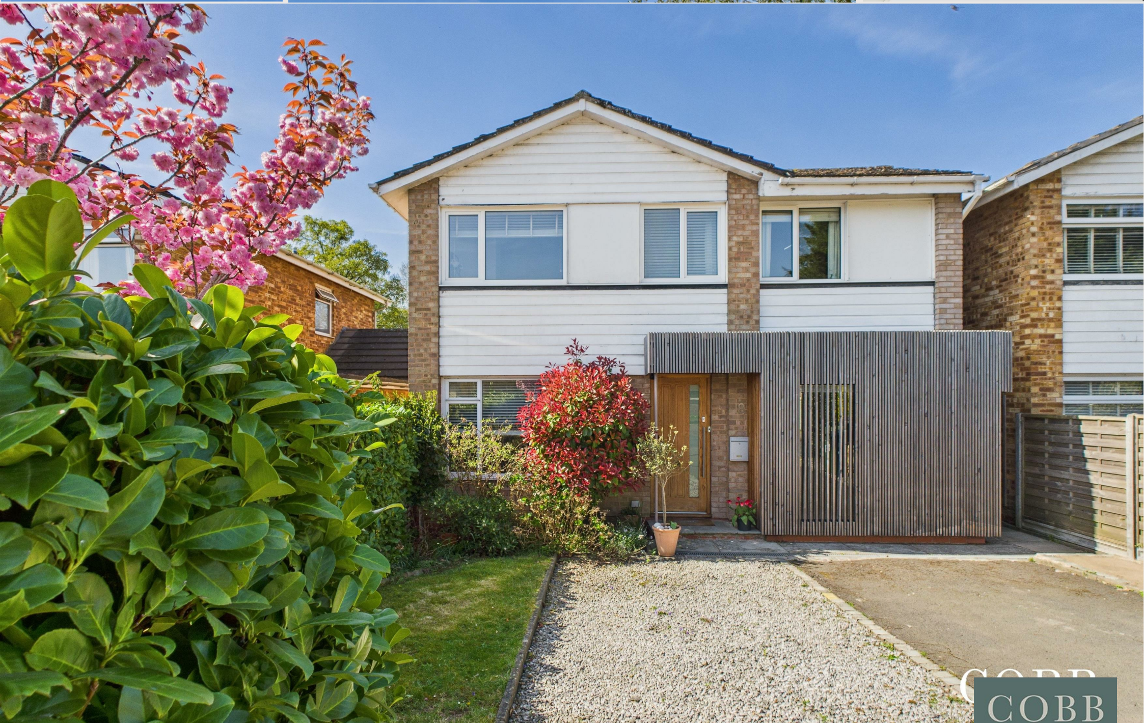
18, Gorsty Lane, Hereford, HR1 1UN Price £410,000