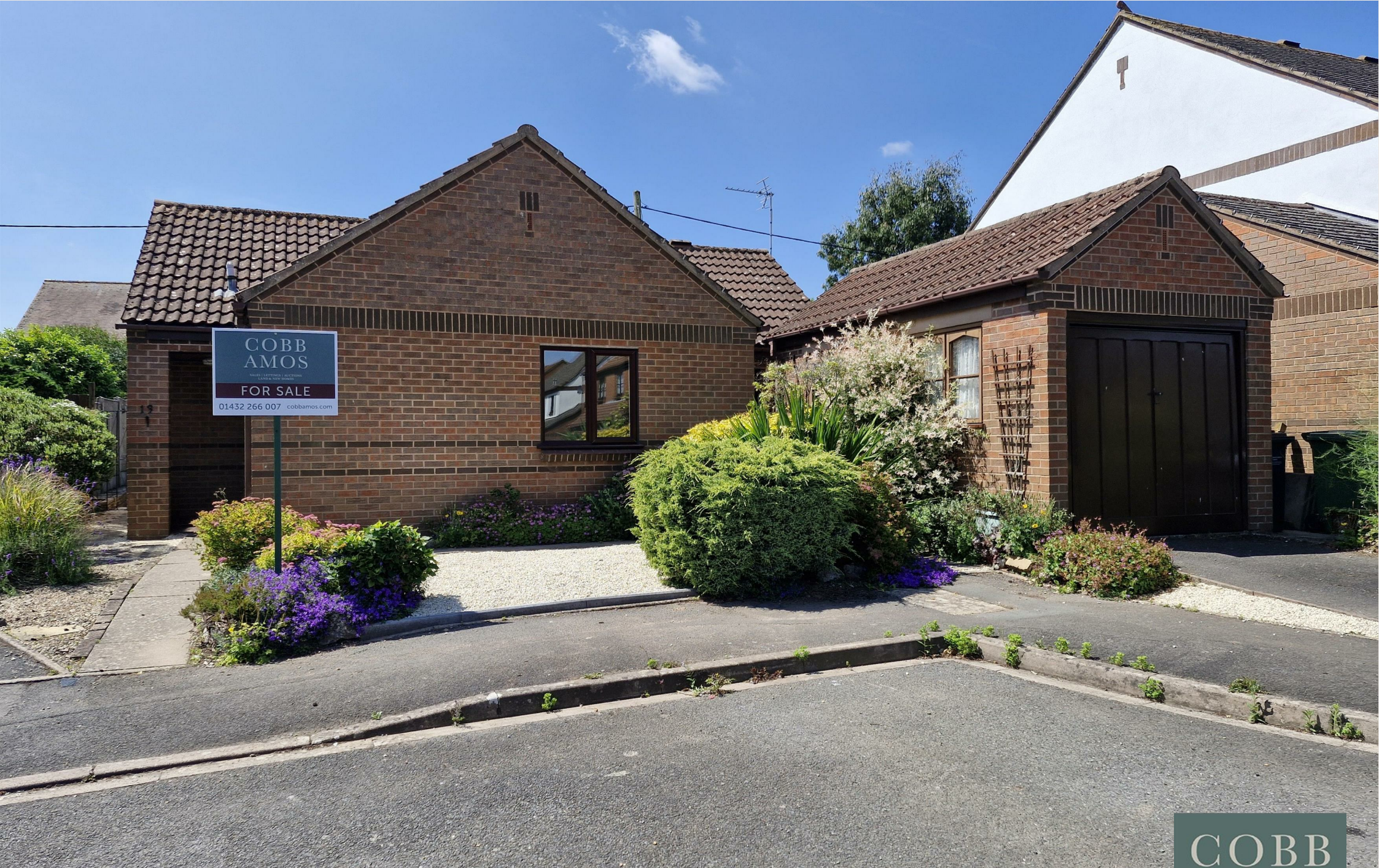
13, Walton Close, Hereford, HR2 6BJ Price £250,000