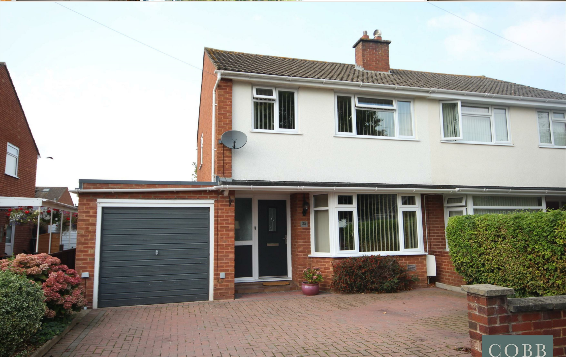
32, Meadow Drive, Hereford, HR4 7EE Price £300,000