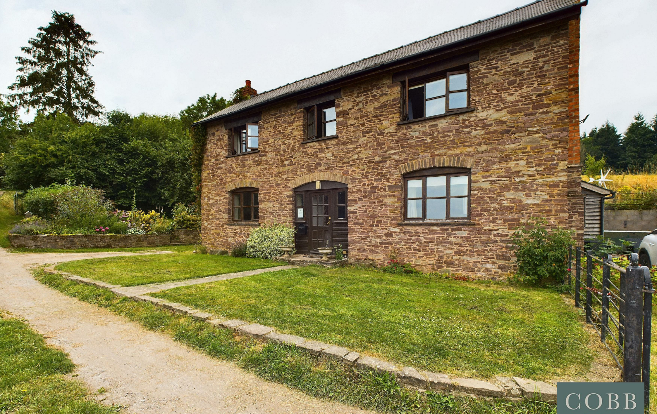
Hill Farm, Letton, Hereford, HR3 6DT Price £1,250,000