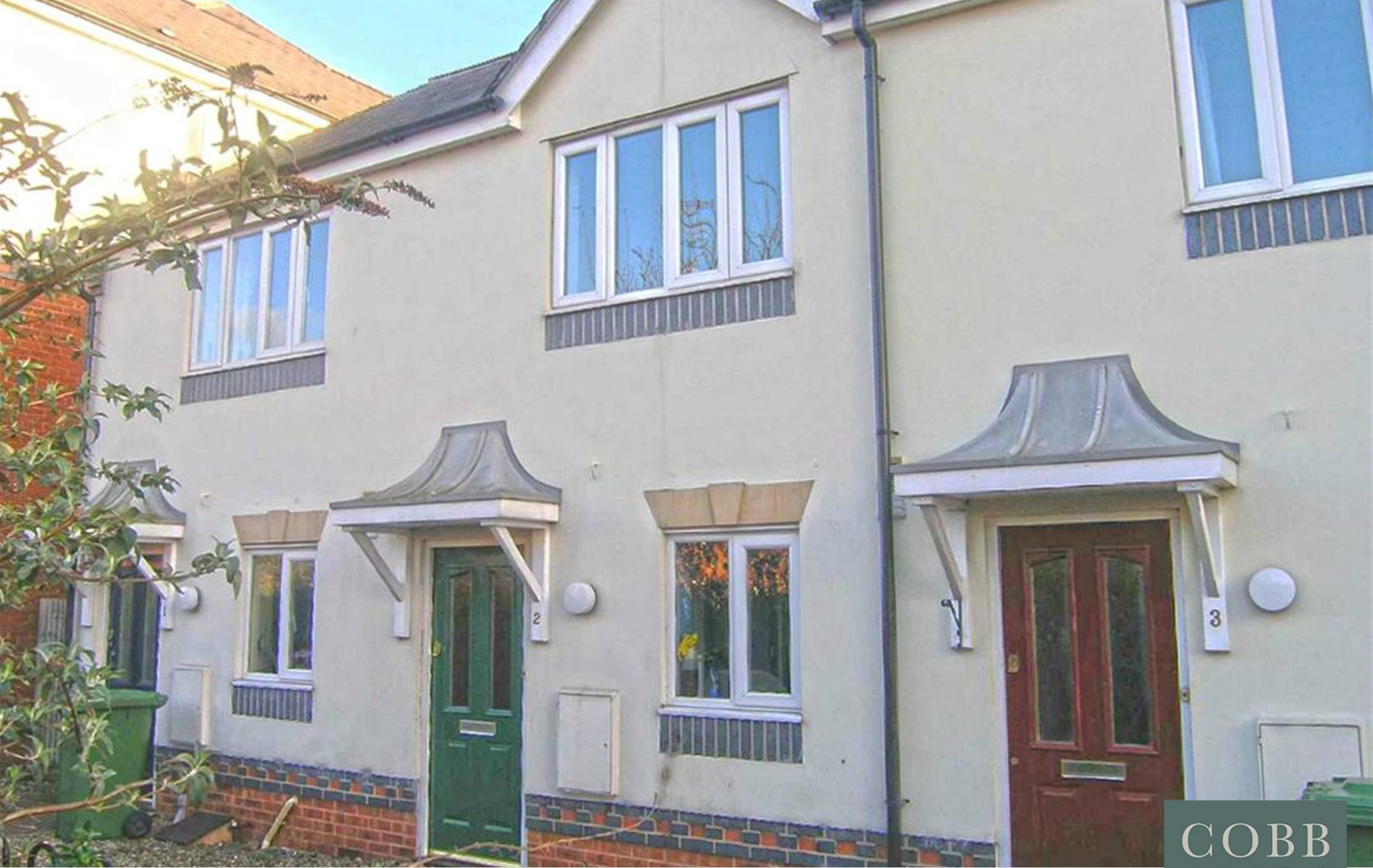
2, Old Mill Close, Hereford, HR4 0AL Price £190,000