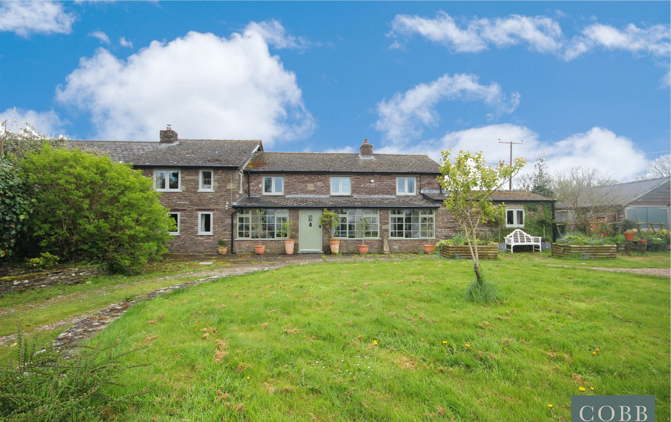
Upper Brooks Farm, Hereford, HR2 0PF Offers Over £650,000