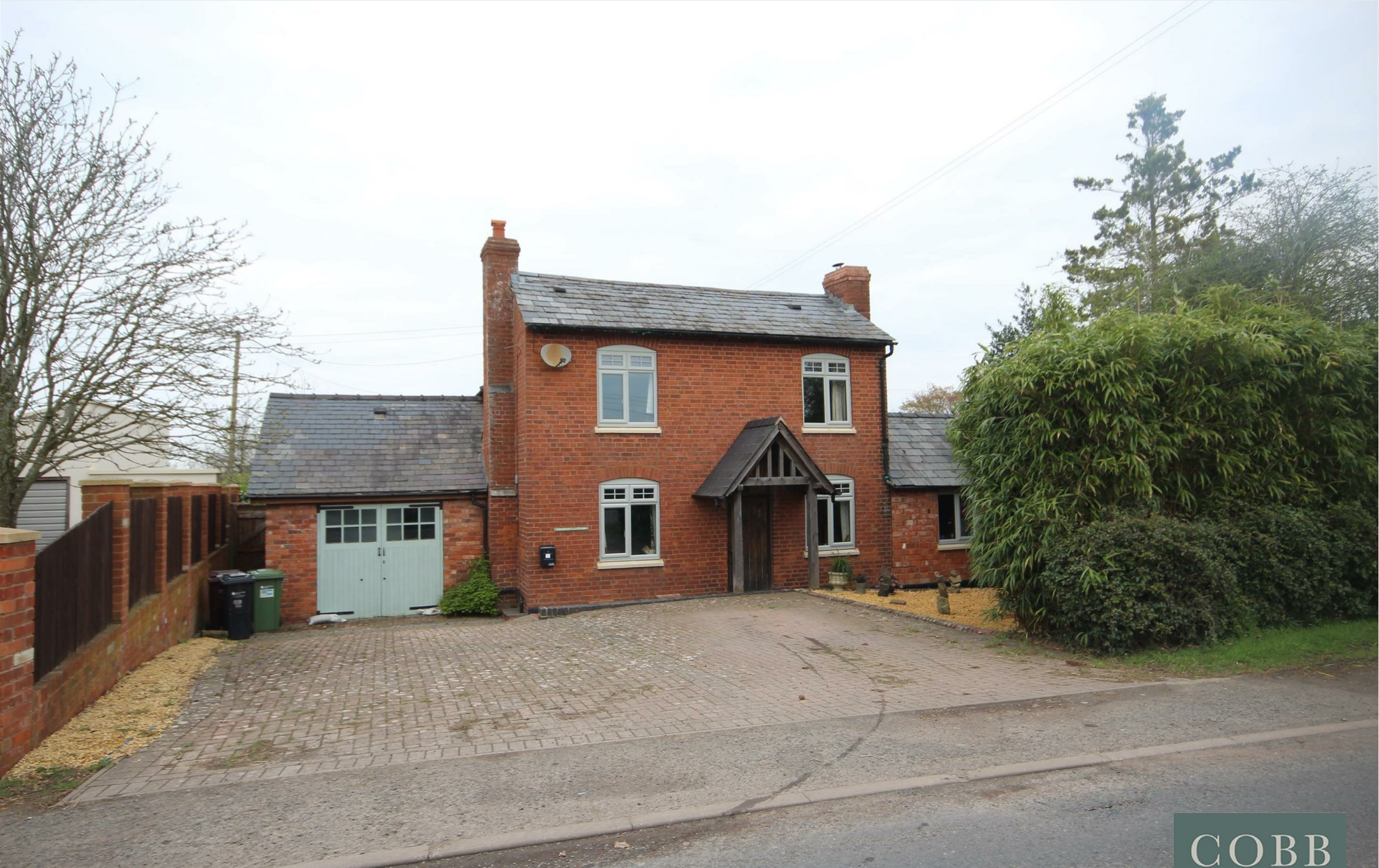
Chestnut Cottage, Burley Gate, Hereford, HR1 3QR Price £449,950