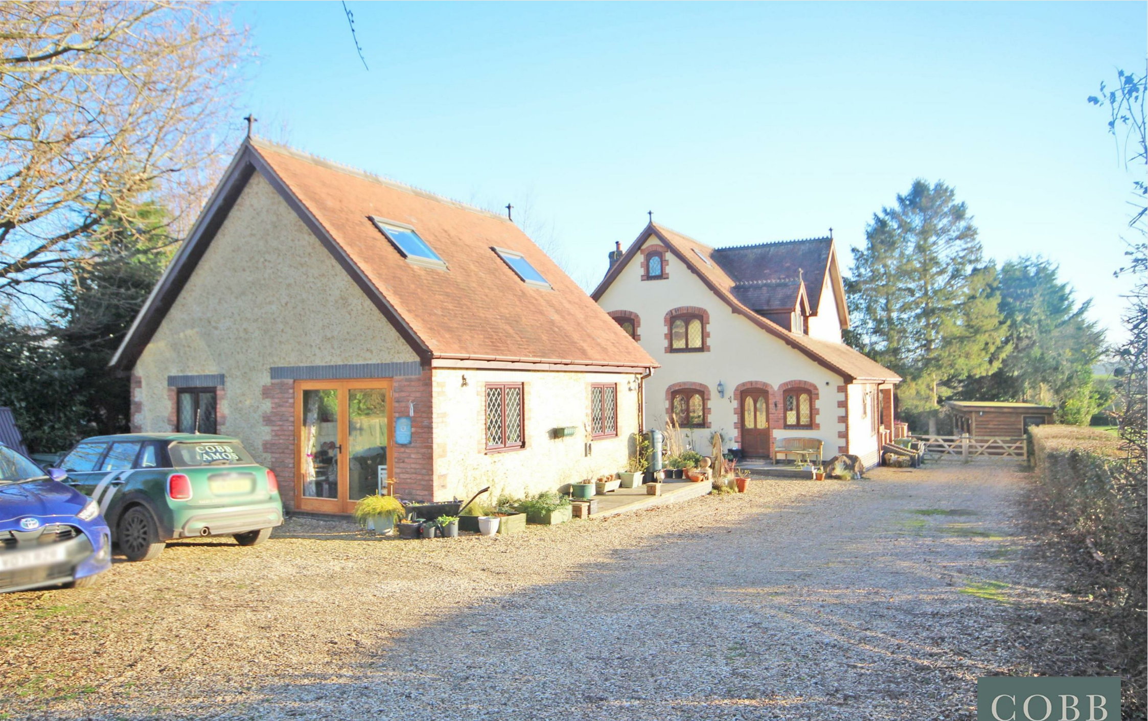
Jersey Cottage, Preston Wynne, Hereford, HR1 3PE Price £750,000