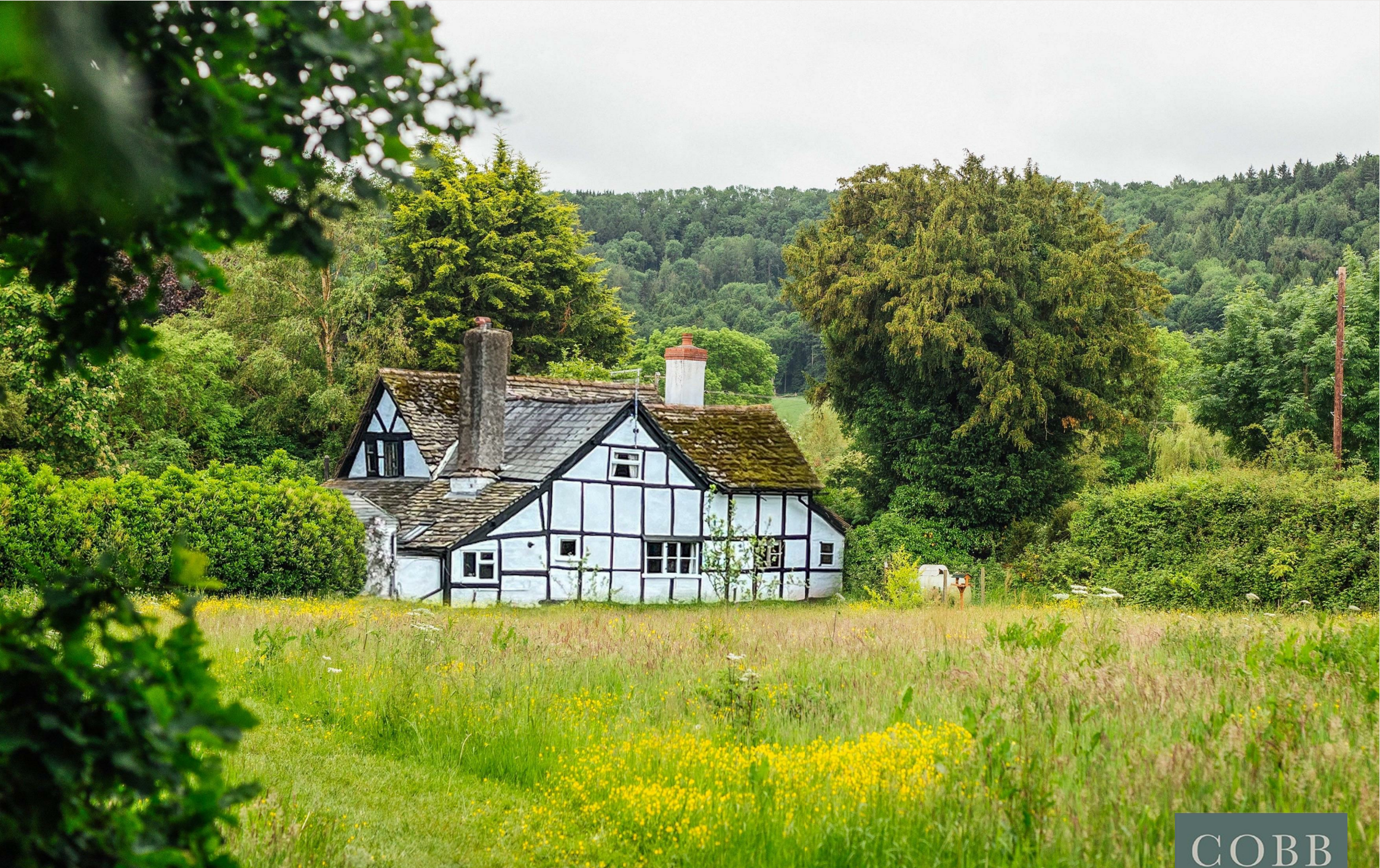
The Plough, Blakemere, Hereford, HR2 9PY Price £825,000