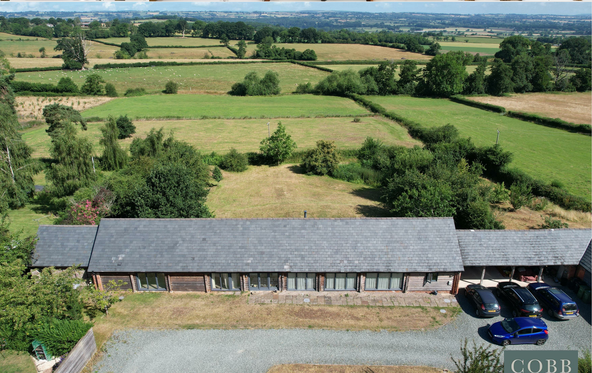
4, Westbrook Barns, Hay-On-Wye, HR3 5SY Price £600,000