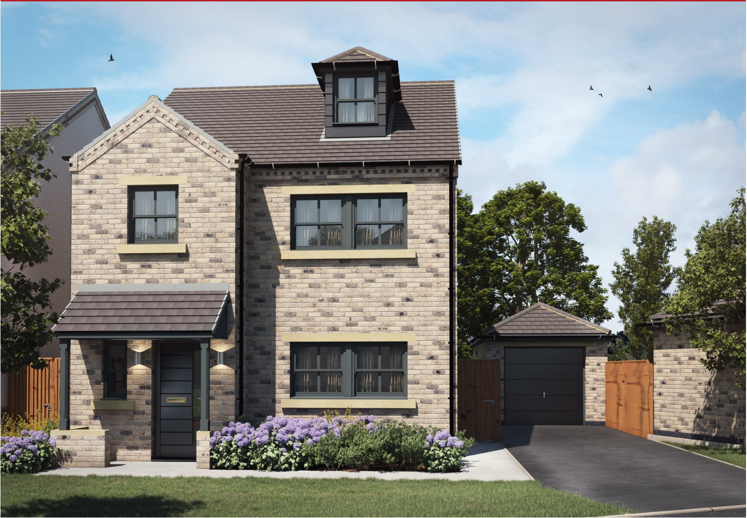
Plot 10, The Cormorant Woodcock Road, Bridlington YO15 £355,000

Please contact our Q & C Hornsea Office on 01964 537123 if you wish to arrange a viewing appointment for this property or require further information.