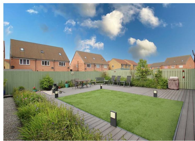
8 Miskin Close, Hornsea HU18 1LH Asking price £292,500