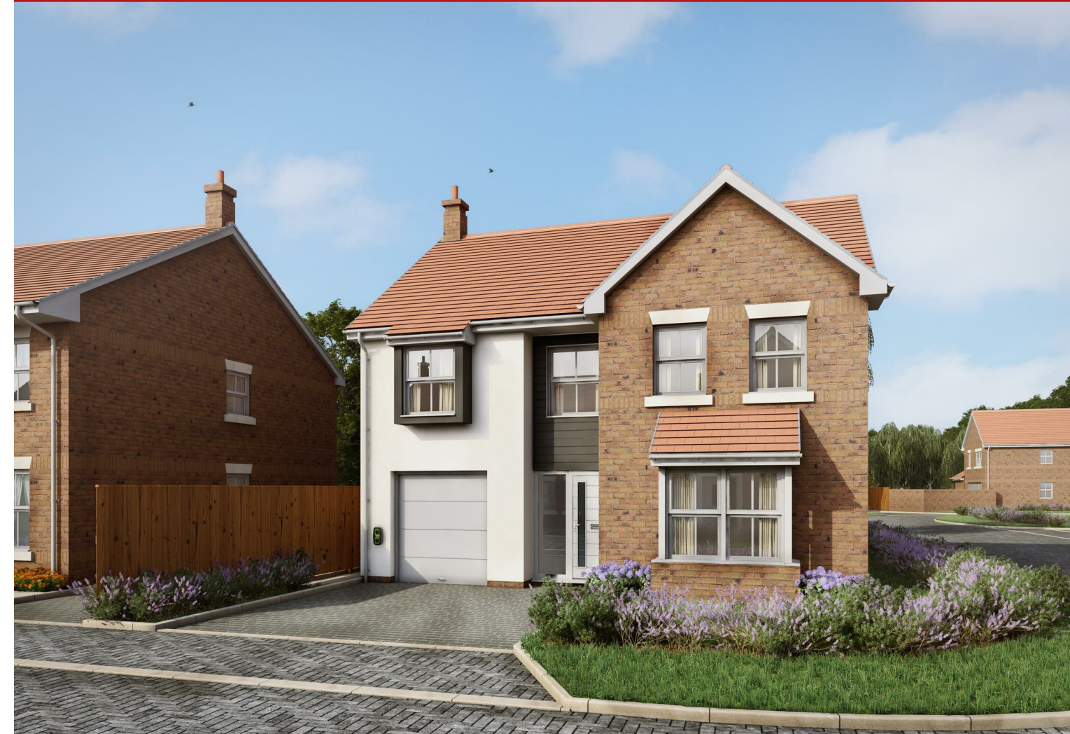
Plot 33 Mere View Meadows, Hull Road, Hornsea HU18 Price £345,000