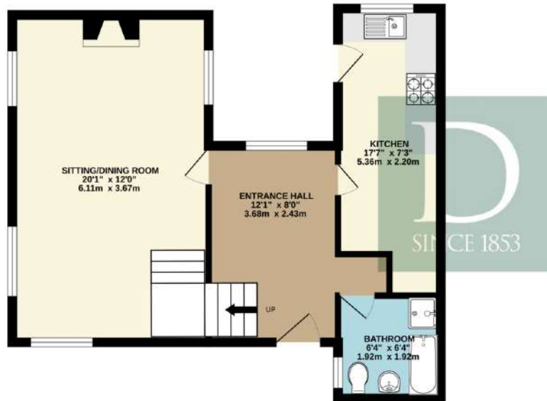
GROUND FLOOR 482 sq.ft. (44.8 sq.m.) approx.