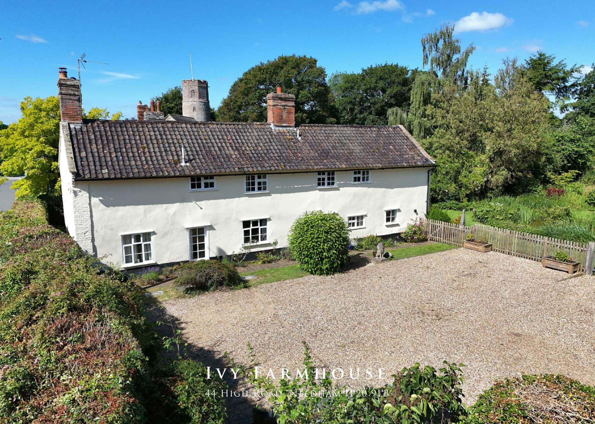
IVY FARMHOUSE 44 HIGH ROAD, NEEDHAM, IP20 9LB