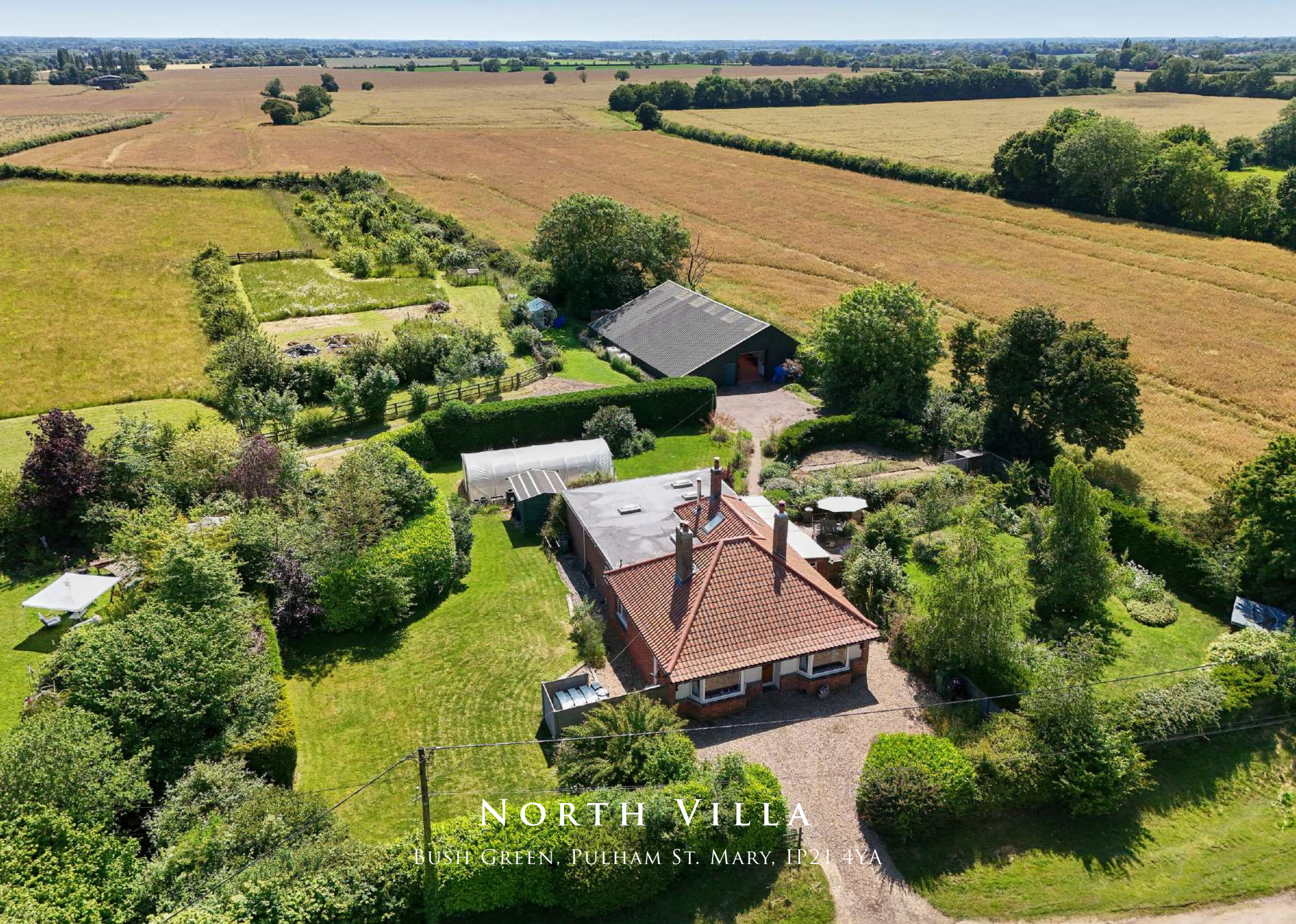
NORTH VILLA BUSH GREEN, PULHAM ST. MARY, IP21 4YA