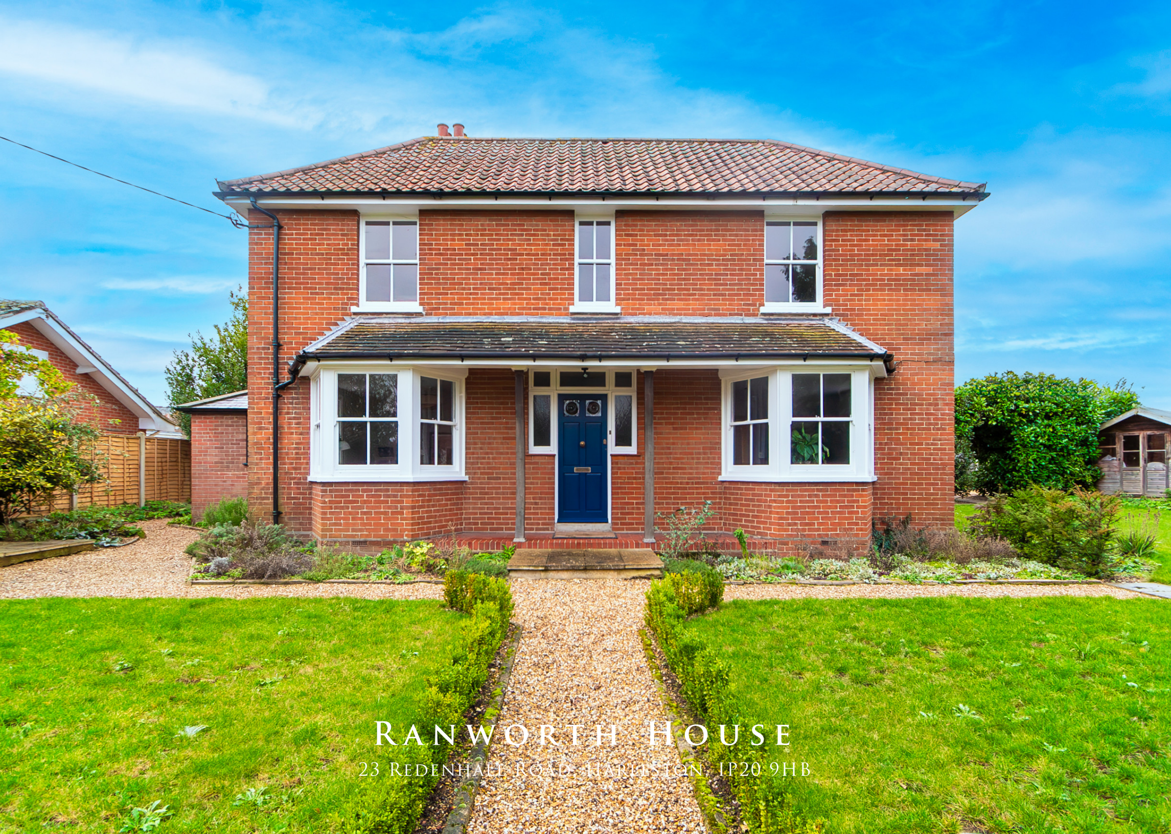
RANWORTH HOUSE 23 REDENHALL ROAD, HARTSTON, IP20 9HB