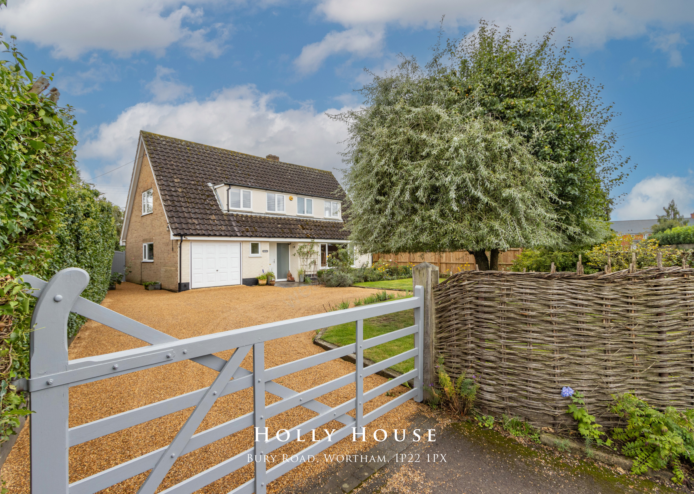
HOLLY HOUSE BURY ROAD, WORTHAM, IP22 1PX