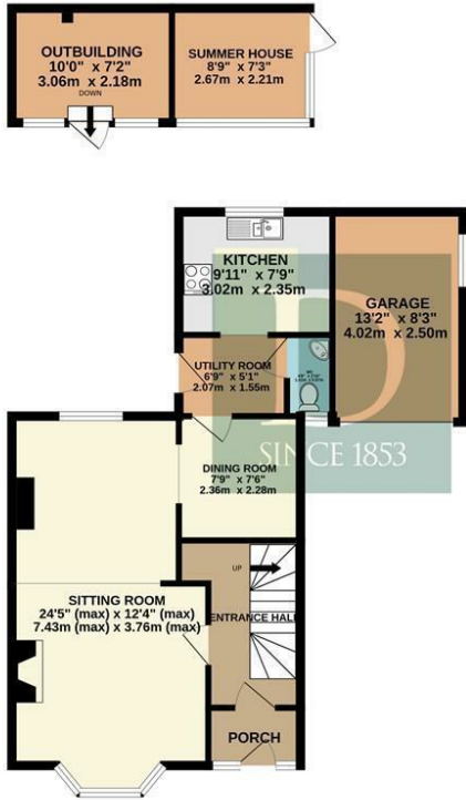
GROUND FLOOR 782 sq.ft. (72.0 sq.m.) approx.