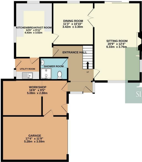
GROUND FLOOR 1066 sq.ft. (99.0 sq.m.) approx.