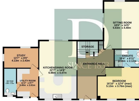
GROUND FLOOR 1382 sq.ft. (126.6 sq.m.) approx.