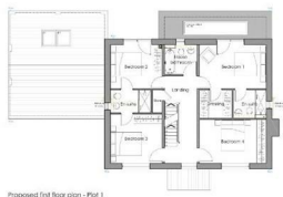
Proposed first floor plan - Plot 1 Scale 1:100 @ A3