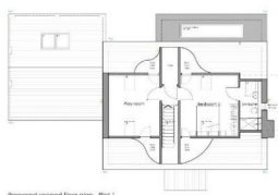
Proposed second floor plan - Plot 1 Scale 1:100 @ A3