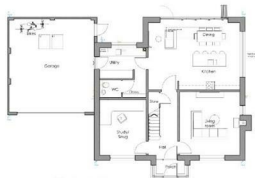
Proposed ground floor plan - Plot 1 Scale 1:100 @ A3