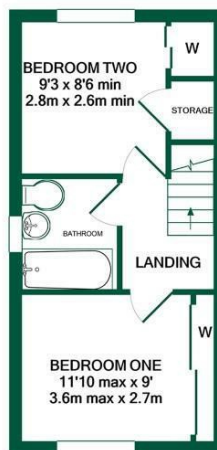
FIRST FLOOR APPROX. FLOOR AREA 296 SQ.FT. (27.5 SQ.M.)