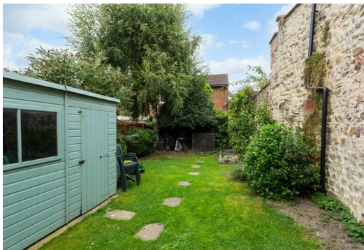
Main Street, Minskip Guide Price £280,000