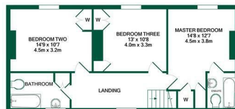
FIRST FLOOR APPROX. FLOOR AREA 682 SQ.FT. (63.3 SQ.M.)