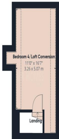
Floor 2 Building 1