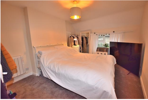
Bedroom 2: 3.36m x 2.38m

With an electric heater and a upvc double glazed window overlooking the rear garden.