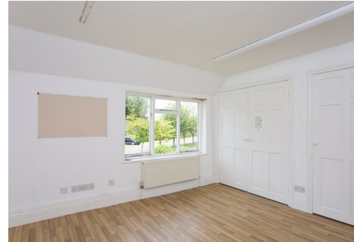
Halifax House, Seaton Ross, York Asking Price £400,000