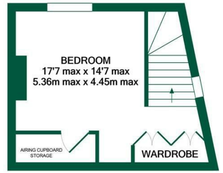
FIRST FLOOR APPROX. FLOOR AREA 225 SQ.FT. (20.9 SQ.M.)