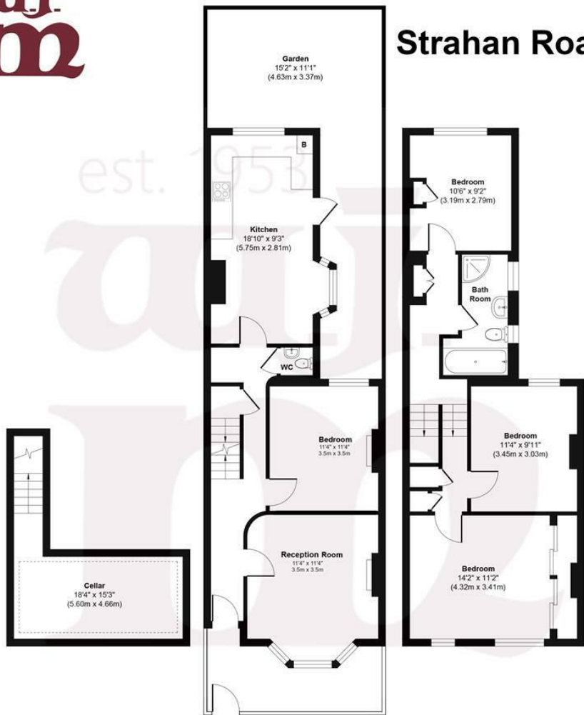
Cellar Approximate Floor Area 142 sq. ft (13.24 sq. m)