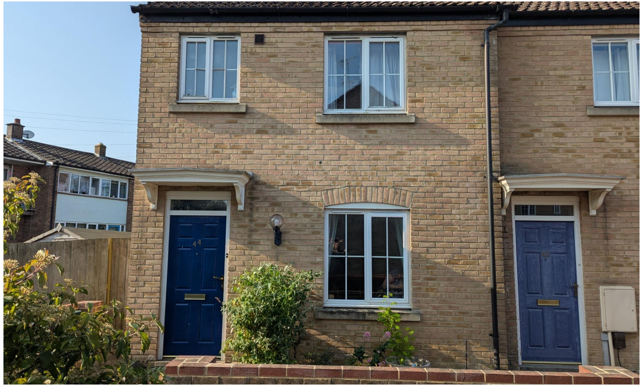
Columbine Road, Ely, Cambridgeshire CB6 3WN