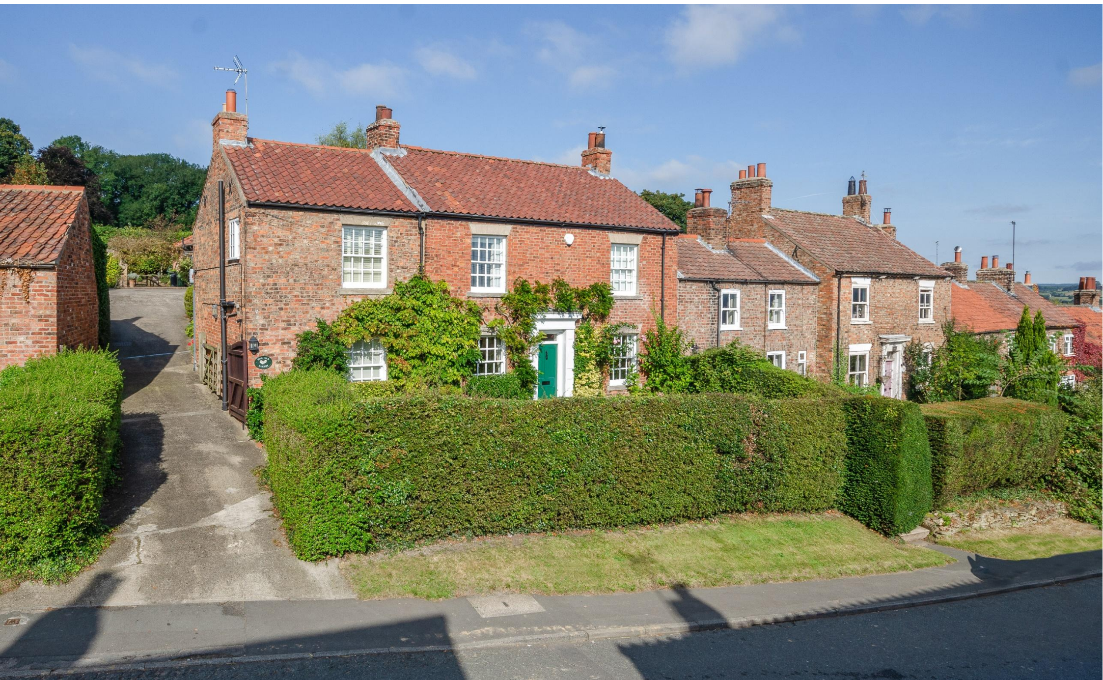
The Old Bakery, Brandsby Street, Crayke, York YO61 4TB