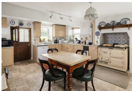
Main Street, Oldstead Guide Price £585,000

A characterful 3 bedroom detached cottage in 0.35 of acre situated in a picturesque village within the breathtakingly beautiful North York Moors National Park. Features include 3 reception rooms and a dining kitchen complemented by generous parking, larger than average triple garage with and glorious rural views to the rear.