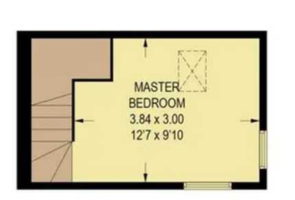
FIRST FLOOR = 14.2 SQ M / 153 SQ FT