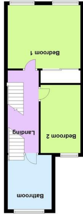
First Floor Approx. 435.3 sq. feet