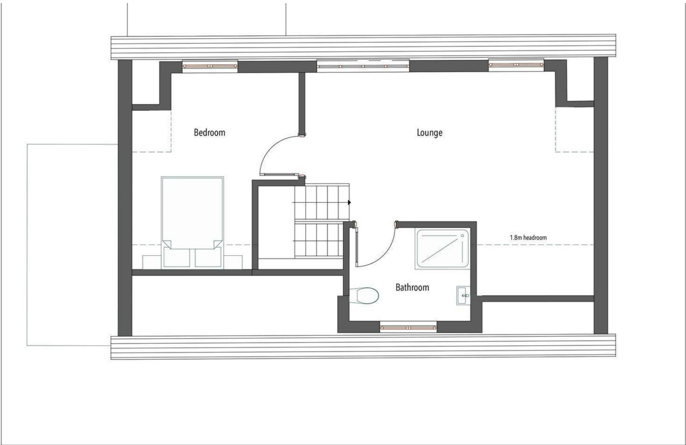
Proposed First Floor Plan 1.50