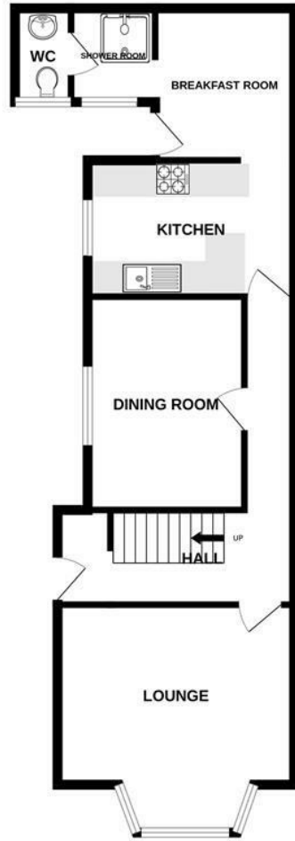
GROUND FLOOR 619 sq.ft. (57.5 sq.m.) approx.