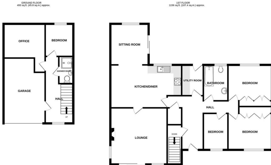
GROUND FLOOR 493 sq.ft. (45.8 sq.m.) approx.