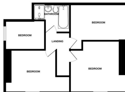
TOTAL FLOOR AREA: 1161 sq.ft. (107.9 sq.m.) approx.

Whilst every attempt has been made to ensure the accuracy of the floorplan contained here, measurements of doors, windows, rooms and any other items are approximate and no responsibility is taken for any error, omission or mis-statement. This plan is for illustrative purposes only and should be used as such by any prospective purchaser. The services, systems and appliances shown have not been tested and no guarantee as to their operability or efficiency can be given. Made with Metropix ©2023